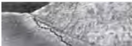
Welding Inspection: Crack through HAZ

Welder (Operator) Approvals (We have Welding Engineers on staff).