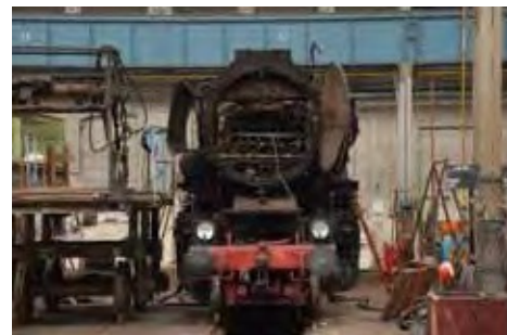
Steam Locomotive Repair for Service

by laws and codes, ECE Global's Surveillance services will review your challenges, provide a strategic plan, and deliver required independent assessment reports.